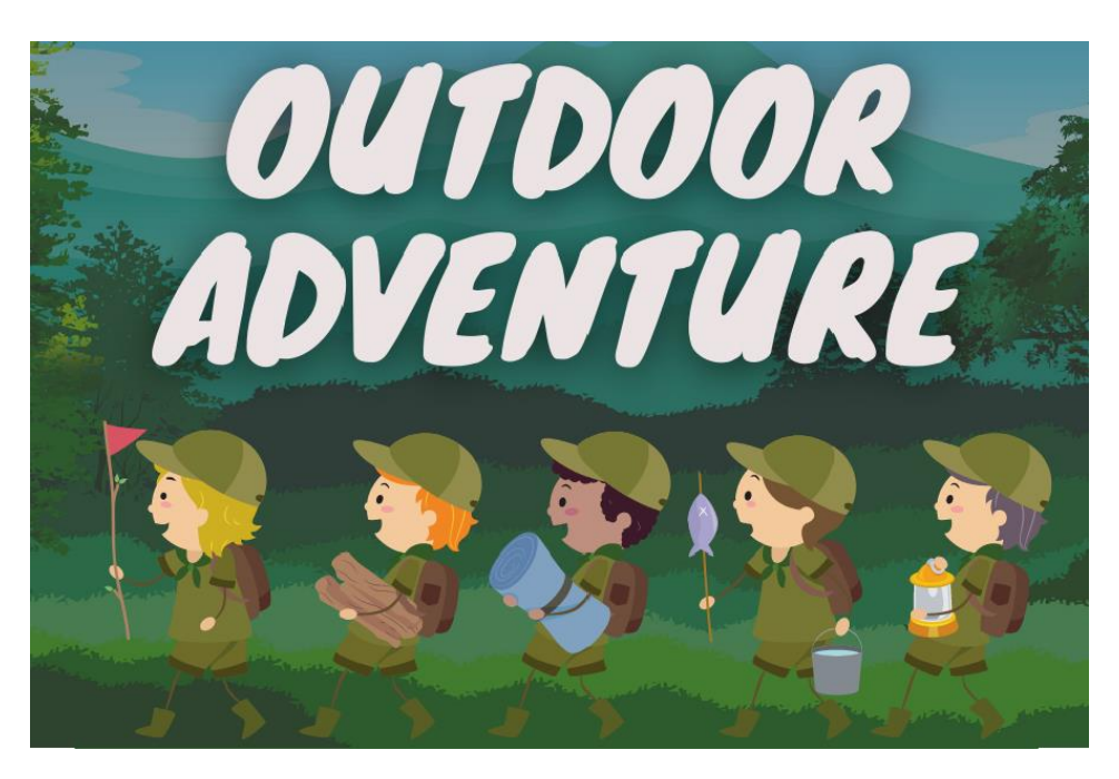
June - Cub Scout Day Camp