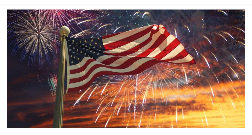
July - Fourth of July Parade

When: Friday, July 4th from 10:30am – 12pm