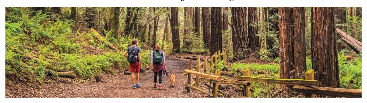
August - West Ridge Hike at Redwood Park