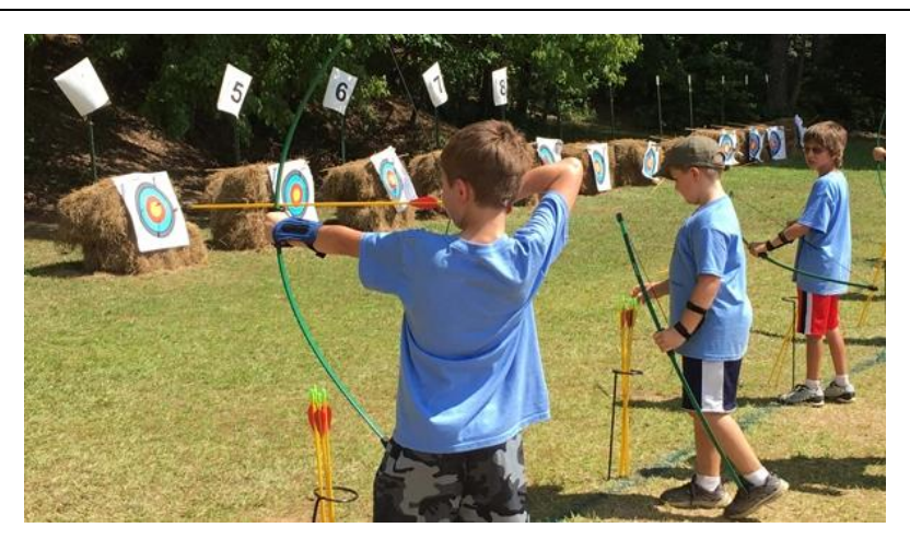
January – Archery Day

Where: 898 Red Rock Rd, Piedmont, CA 94611