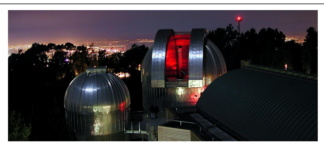
April – Odyssey Overnight

**REGISTRATION REQUIRED via Council Event Page HERE**