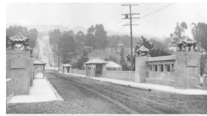
The Oakland Avenue Street, Built by the City of Piedmont in 1910. Looking Eastward.